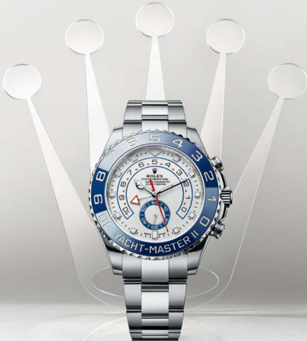
OYSTER PERPETUAL YACHT-MASTER II

The ultimate skippers' watch, steeped in yachting competition and performance, featuring an innovative regatta chronograph with a unique programmable countdown. It doesn't just tell time. It tells history.