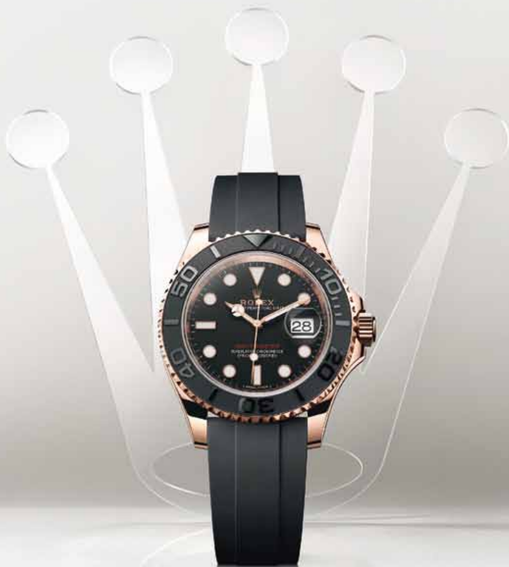
OYSTER PERPETUAL YACHT-MASTER 40

The emblematic nautical watch embodies a yachting heritage that stretches back to the 1950s. It doesn't just tell time. It tells history.